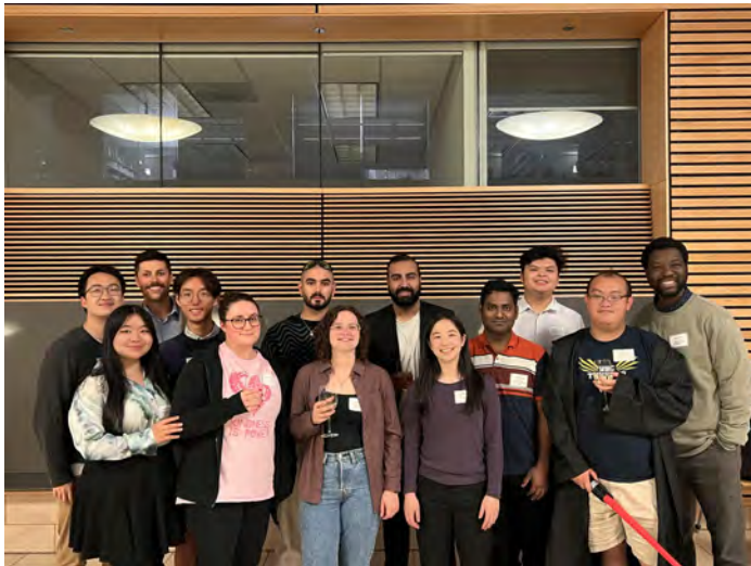
UBC Student Senators at the Reception after the UBC Senate Meeting on 20th September, 2023