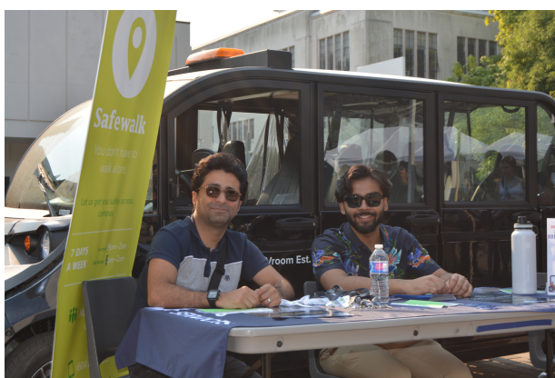
The Safewalk Team bothing at the Student Resource Fair