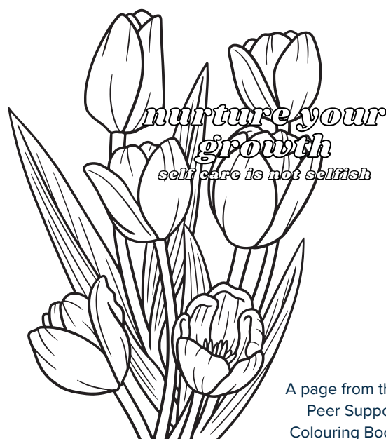
A page from the Peer Support Colouring Book